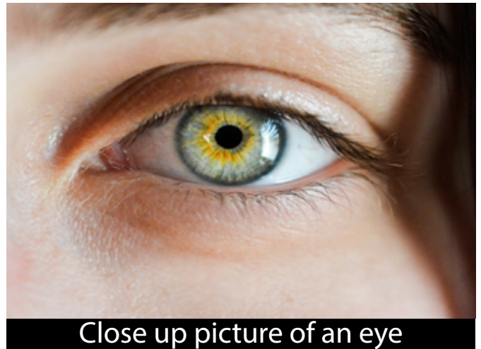
Close up picture of an eye

The brain implant, which is approximately the size of a penny works by bypassing the optic nerve and instead provides stimulation to the brain's visual cortex. The research also found that the implant did not cause any harm to the woman or create any negative side effects.