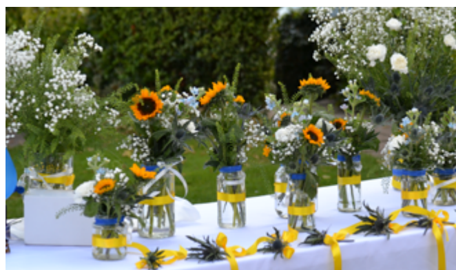
Floral arrangements for the raffle

the Royal Navy, Air Force and Army cadets to present the award.