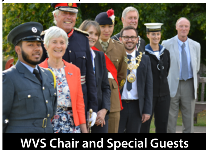
WVS Chair and Special Guests

After a while of catching up and mingling, The Lord Lieutenant of Warwickshire began the ceremony, joined with representatives from