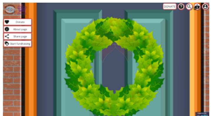
WVS' Virtual Christmas Wreath

Please visit https://visufund.com/warwickshire-vision-supports-christmas-wreath for more information