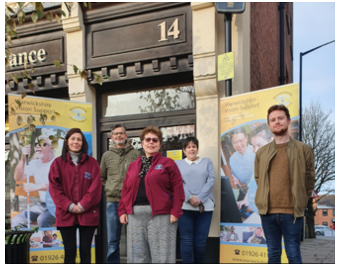
WVS staff outside our new HQ

Our new building will make it a lot easier for people who are using public transport as there are many public transport links across the county to Warwick's town centre.