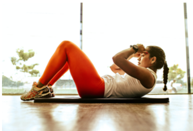
Woman exercising indoors

in British Blind Sport's efforts to create accessible and safe at home environments for exercise include regular and consistent uploading of audio exercise routines.