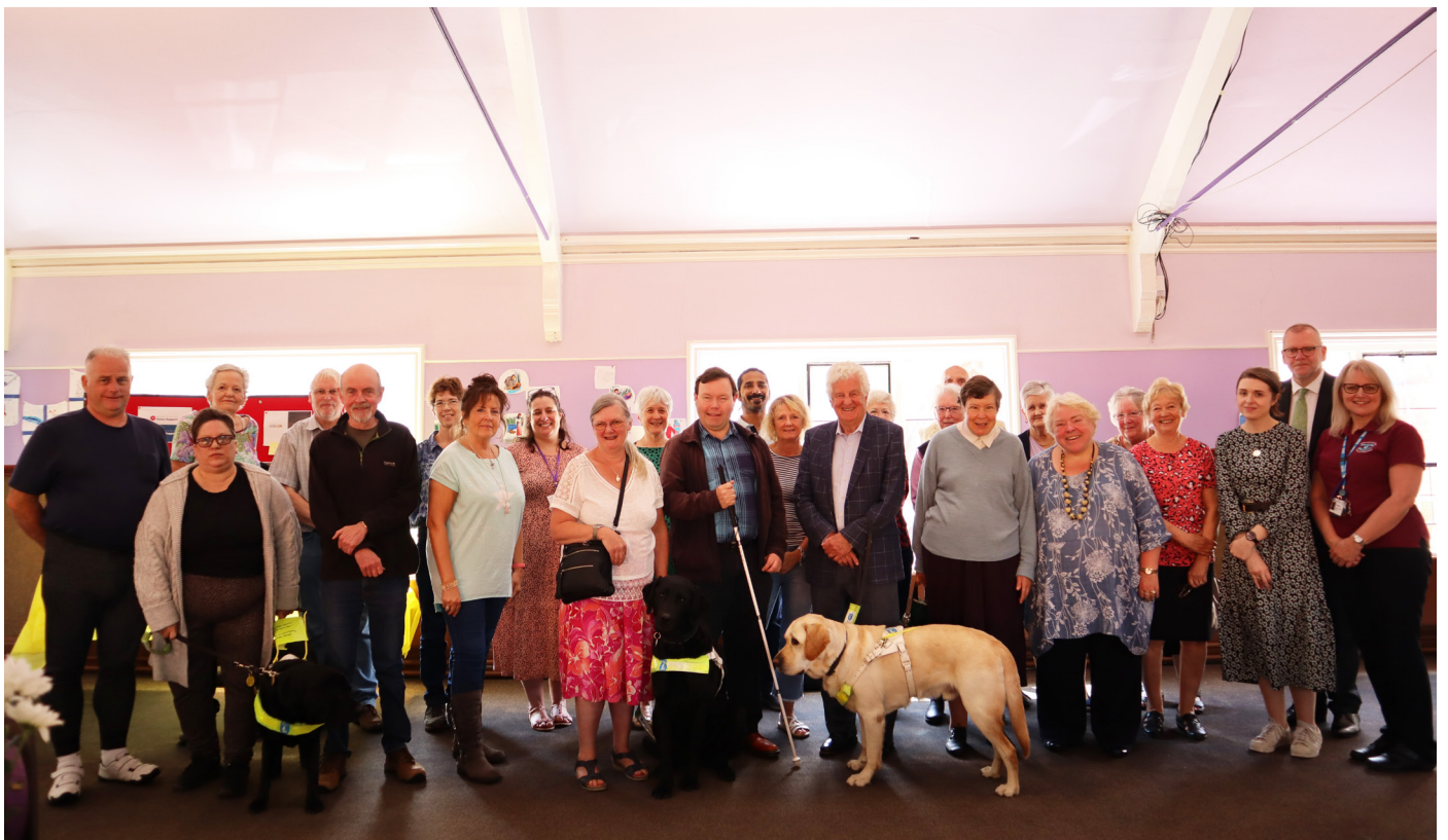
A group photo of our volunteers at the volunteer celebration in Rugby