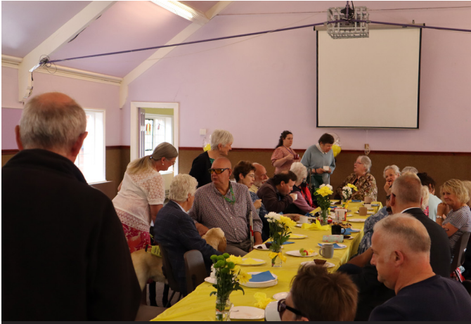
Volunteers mingling and catching up with one another at the event

After the speech, our guests were invited to tuck in to a vast array of drinks, cakes and other treats while our volunteers were given the chance to talk to each other openly and catch up on their achievements throughout the year.