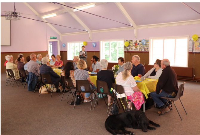
Guests taking part in the summer-themed quiz