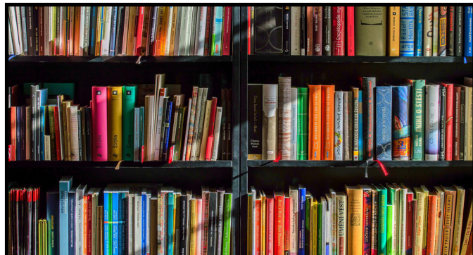
A picture of a collection of library books

Borrowbox is an eBook and eAudio book loaning service, and this can be used on lots of devices such as