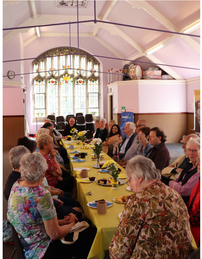
Volunteers enjoying some drinks and cakes together

Overall, the celebration was a success. It was fantastic to have our volunteers in one place and to be given the opportunity to meet each other and thank them individually for their hard work.