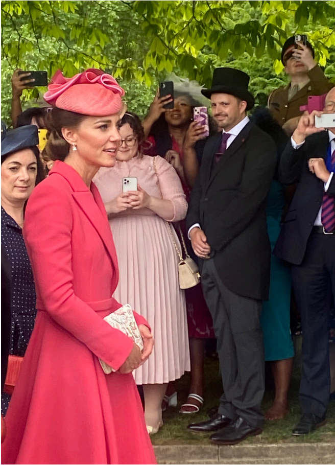
Kate, the Duchess of Cambridge attending the Royal Garden Party

mingle with some of the other Royal Garden Party Attendees. After some time of relaxing with other attendees, Martyn and Stacey and the other attendees were greeted by Catherine, the Duchess of Cambridge, Prince Edward, the Earl of Sussex, and Sophie, the Countess of Wessex.