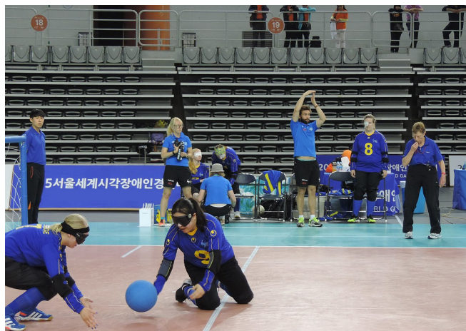
People playing goalball at the last IBSA games in Seoul, Korea