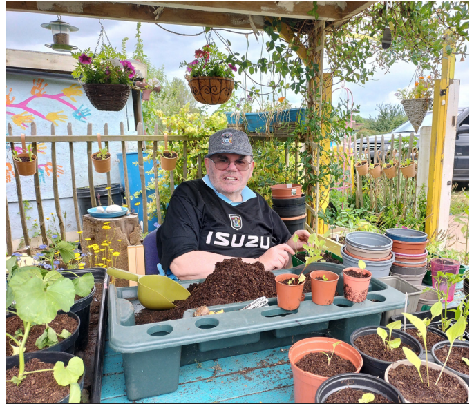
A member of the allotment club with his plants